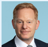
Laurence Lieberman Litigation & Global Disputes