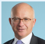
James Campbell Corporate